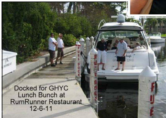
Docked for GHYC Lunch Bunch at RumRunner Restaurant 12-6-11